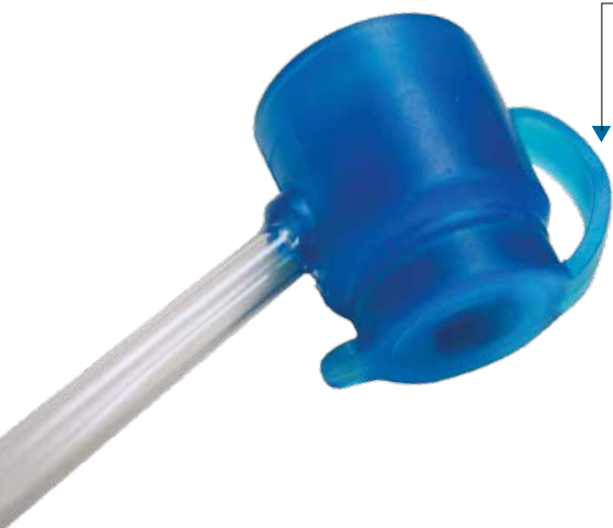
LOCTITE® 3922™ bonds thermoplastic inlet valve assembly.

By using the LOCTITE® 7700 Hand-Held LED Light Source with LOCTITE® 3922™ Medical Device Light Cure Adhesive, US Endoscopy was able to consistently cure the assembly in 10 seconds, while nearly doubling the pull strength. This was possible because the spectral output of the LOCTITE® 7700 LED Light Source is very high-intensity visible light (as opposed to UV light) and the wavelength of the visible light exactly matches that absorbed by LOCTITE® visible light cure adhesives. Other benefits of this light source are that it is inexpensive, small in size, portable, and generates minimal heat and minimal ultraviolet energy, making it safer to work with than traditional UV light sources.