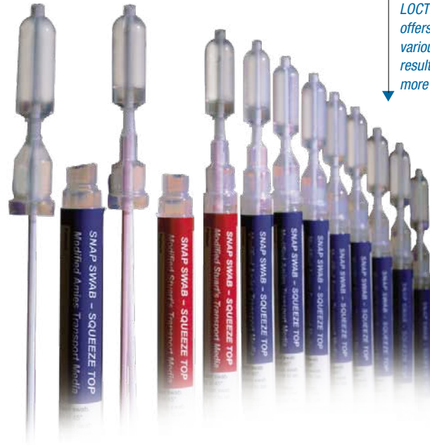
LOCTITE® 3311™ offers adhesion to various swab substrates, resulting in a safer and more reliable device.